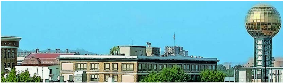
View from Gallery Lofts roof looking west.