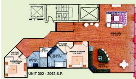
UNIT 302 - 2062 S.F.